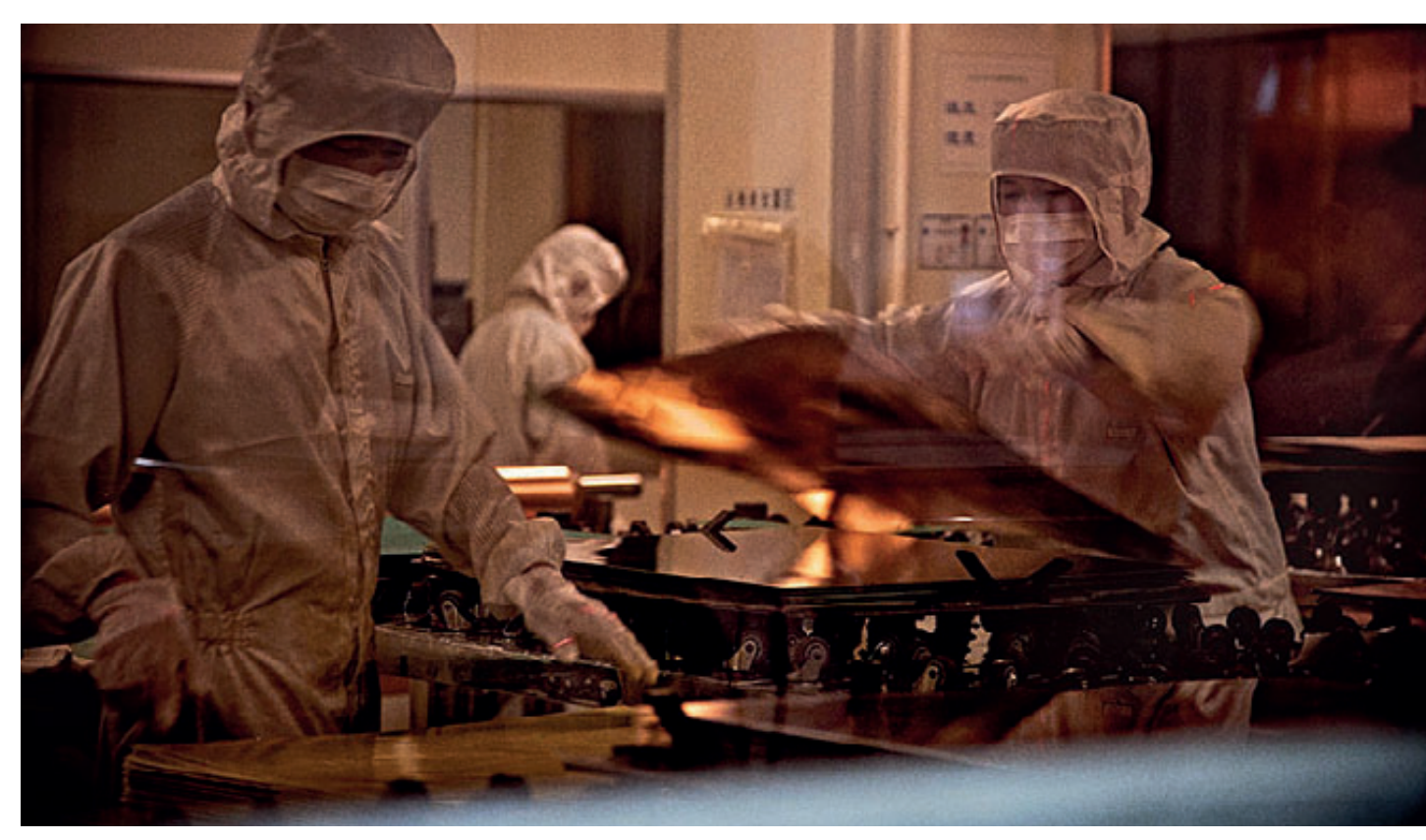
NCAB requires high standards of cleanliness, e.g. as seen here in the construction of multilayers prior to pressing.

For instance, NCAB makes more rigorous demands on the thickness of plated through hole copper. Thicker through hole plating ensures that each PCB can much better withstand, the effects of soldering, potentially avoiding the risk of material fatigue which can ultimately lead to intermittent faults at a later date. NCAB also demands higher standards of cleanliness on finished and delivered PCB's, it is a well known fact that contamination on the PCB can cause short-circuits during and even after assembly, often leading to expensive rework or replacement.