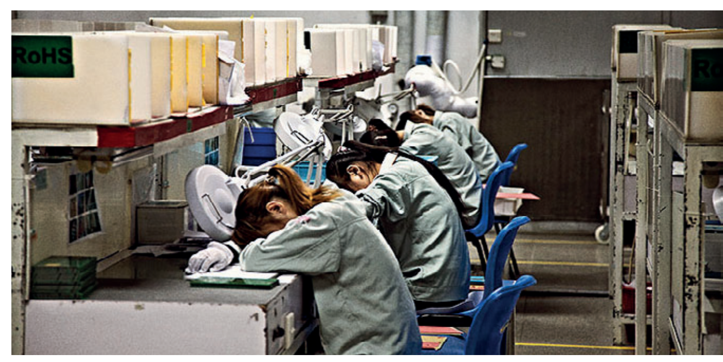
To maintain total focus, personnel assigned to inspecting PCBs take regular breaks.

PCBs from the NCAB Group deliver a quality level that can more than pay for itself over time. With an industry unique product specification that sets exceptional standards and stringent quality control, combined with a high level of purchasing power, ensures the factories do adapt to achieve the NCAB Groups requirements.