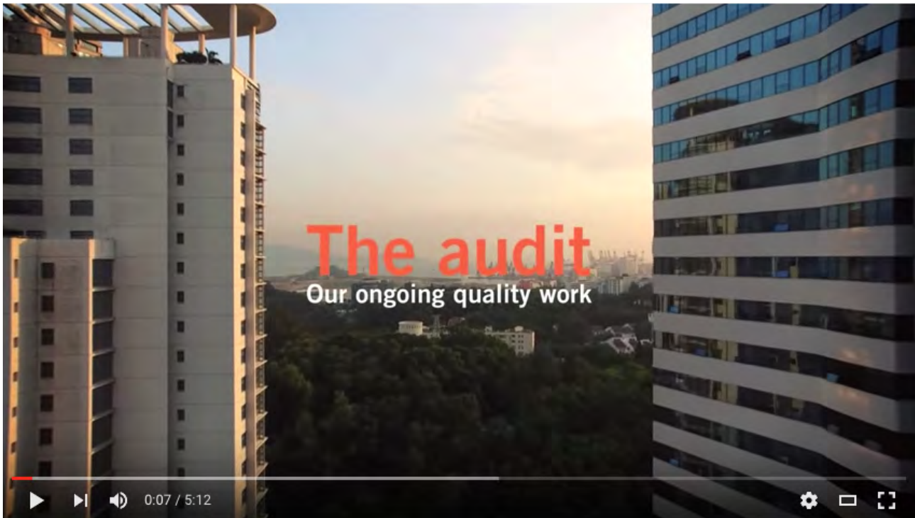
The annual audits are supplemented with monthly meetings, process audits in areas that need special attention, as well as audits of the plant's sustainability and CSR work. To learn more about that, please see our film about audits. See film >>

“Apart from asking the factory to deliver according to our specification and acceptance demands, we also require them for example, to only use NCAB approved materials, in some cases processed on NCAB approved equipment and that they meet specific lead times. NCAB also makes a point of clearly describing, right from the start, how we would like to work with a factory. We insist on training teams within the factory to ensure they understand our specification, our way of working and implement it in the factory's processes.