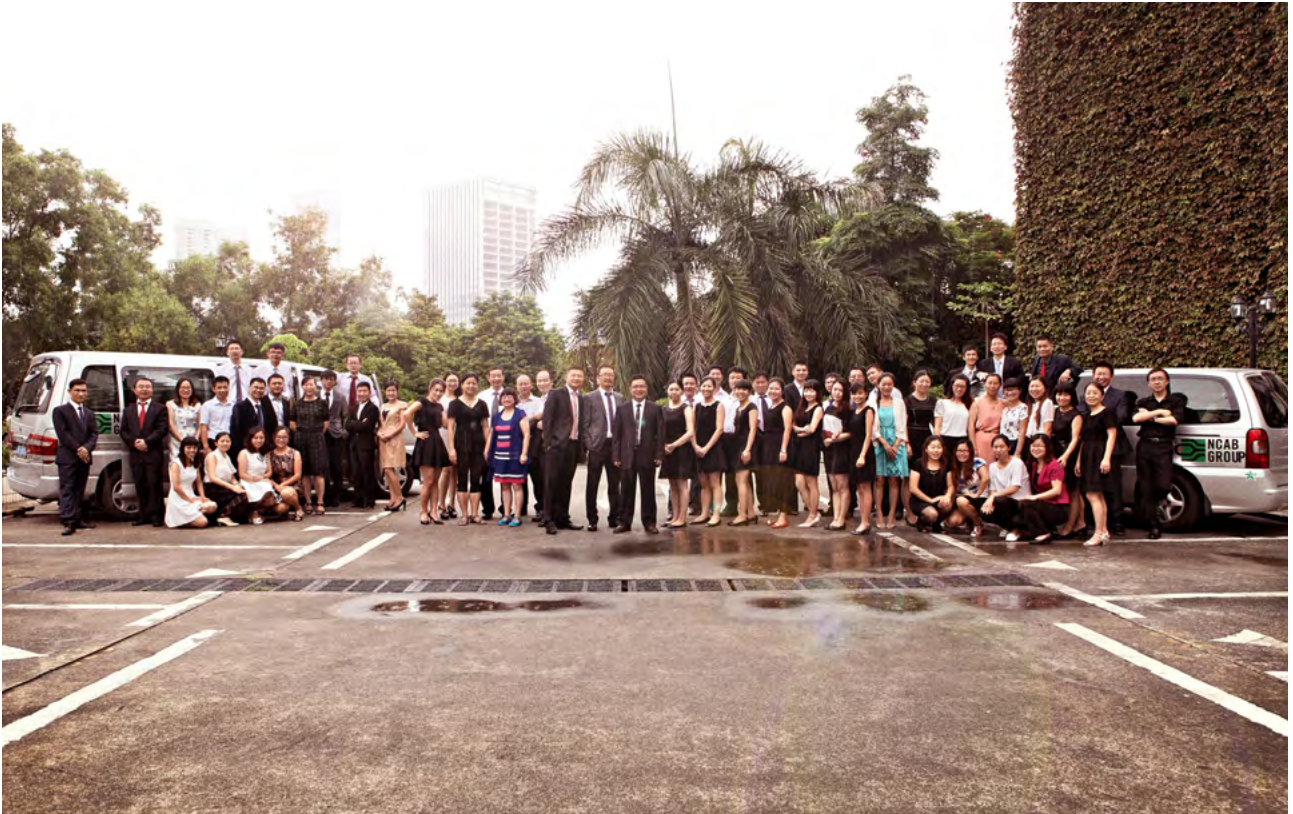
The NCAB Groups office in China has 57 employees who possess a thorough and broad knowledge of PCB production. They monitor and follow up on site.