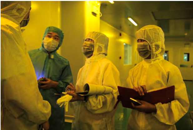
NCAB's annual audits, involve three of the company's staff, working on site for three days.

"Another important factor is the audits we carry out - all of them. They are a key part of our continuous improvement efforts. We have a strong team working at a great level of detail and with such an approach these are not standard audits that replicate an audit against an ISO standard. NCAB's audits, as well as looking at elements of their management system, are extremely thorough. They are based on extensive experience of manufacturing, where we ask such questions as "How do they really go about making their products at the factory?" "How well do they make them batch to batch against the demands?" "What will we get out of them?" The audit document is a very strong tool to validate that a factory is up to standard.