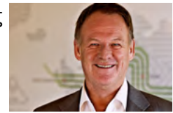
HANS STÄHL CEO NCAB GROUP

Judging by the way our buying habits have changed in recent years, where we’ve been increasingly turning to on line channels, it is easy to come to the conclusion that proximity is no longer an important factor. Nevertheless, I am convinced that nothing is going to replace physical presence when it comes to creating the right platform to manufacture and supply the optimum PCB. A person in the factory, working for example, on improving the soldering process, can never be replaced by an IT service, since the task they are involved in requires days of interaction with factory operators and process engineers.