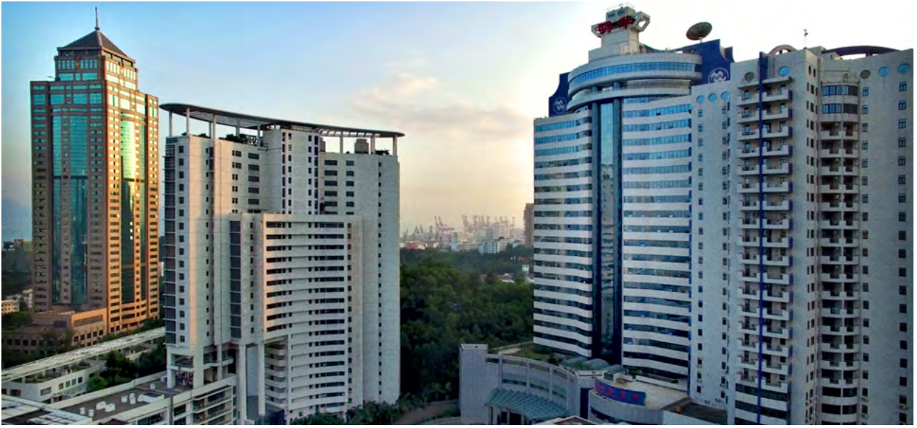
About 60 percent of the PCB production in China is located in southern China, centered in Shenzhen. This is also where NCAB Group China has its head office (to the right in the picture).

production in the country is located in Southern China, centered in Shenzhen, 30 percent in East China, near Shanghai and 10 percent inland, in provinces such as Jiangxi, Sichuan, Hunan and Hubei.