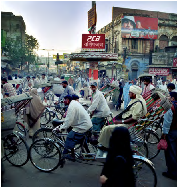
We are seeing an increase in the production of printed circuit boards in India. But for them to become an important player in the world market, will require the right kind of investments in materials, equipment and technology, as well as improved electricity and water supplies.

At the same time, we also see the continuation of the PCB industry in Southeast Asia. This is being driven mainly by foreign investments, for example, setting up operations in Thailand and Malaysia. Together, the countries in Southeast Asia account for 6 percent of world production. We are also seeing an increase in the production of printed circuit boards in India.