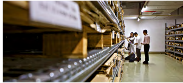
China will most likely manage to maintain its competitiveness. The skilled manpower is there, both when it comes to management and factory personnel. In the picture Ellefen Jiang, PCB Design Manager NCAB Group China, is inspecting materials in a factory together with her colleagues.

In the case of high-tech boards and boards with short lead times, NCAB is already evaluating the options available in countries such as Taiwan and South Korea. If it turns out that their factories can deliver value to NCAB customers that is above and beyond what the factories in China are doing, we may well see NCAB extending its