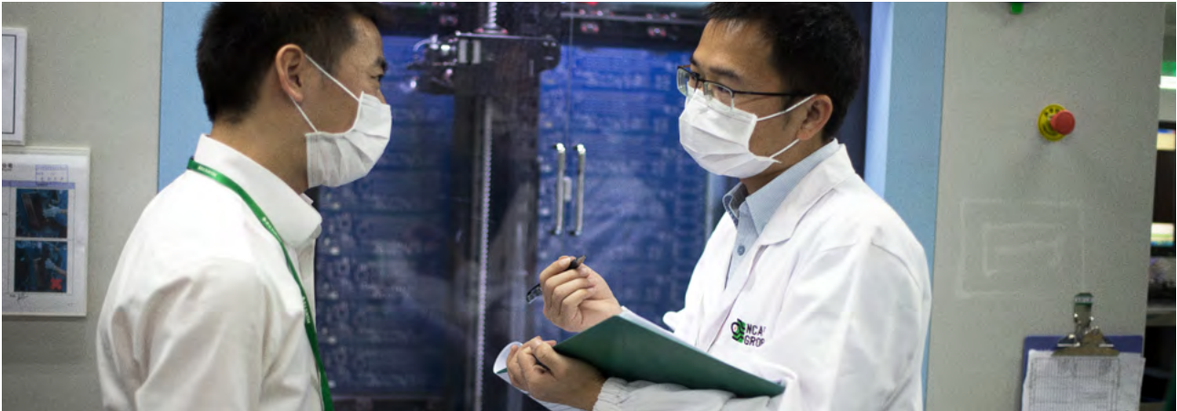
To ensure the best quality for our customers, we set up a dedicated team from among the factory's own staff. We train this dedicated team ourselves, an approach that boosts the quality of the final result. This essentially results in us having 20 quality inspectors on-site instead of two.

“We use an application we have developed ourselves that enables us to see in real-time whether the PCB deliveries are on track, with the system alerting us if it detects a risk of a delivery being delayed.”